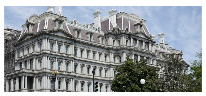
EISENHOWER EXECUTIVE BUILDING Project management for full-building, major modernization of 686,000 SF historic federal office building.