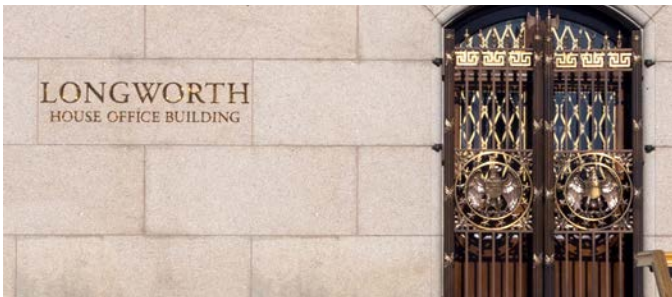
U.S. HOUSE OF REPRESENTATIVES Space and furniture planning for over 250 office suites within House Office Buildings as well as the U.S. Capitol Building itself.