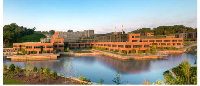
DHS CONSOLIDATION AT ST. ELIZABETHS Program management for $4.5 billion redevelopment of 176-acre campus with 4.5 million SF for 17,000 personnel.