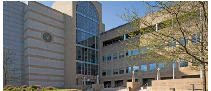
SOUTHERN MARYLAND COURTHOUSE Project management for multi-phase Bridging-Design-Build renovation of this 297,000 SF federal courthouse.