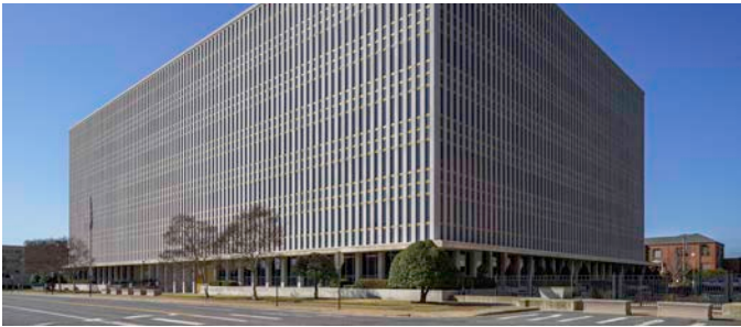
LITTLE ROCK FEDERAL BUILDING Project management and commissioning for building envelope repair and systems modernization in occupied 370,000 SF building.