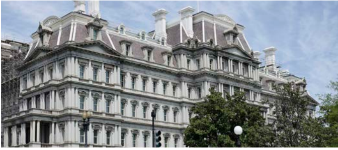
EISENHOWER EXECUTIVE BUILDING Project management for $588 million modernization of occupied 686,000 SF, high-security, historic, federal office building.