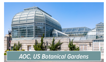
AOC, US Botanical Gardens