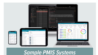
Sample PMIS Systems