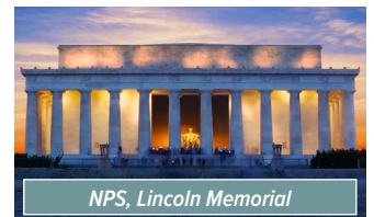
Lincoln Memorial