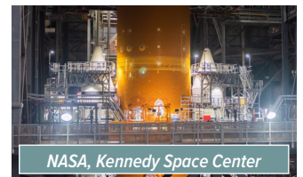
NASA, Kennedy Space Center