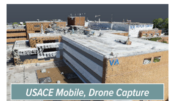
USACE Mobile, Drone Capture